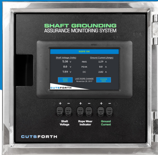
Fig 1. Cutsforth™ Assurance Monitoring System (10" x 10")