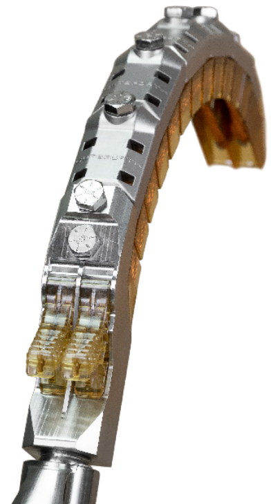
Cutsforth™ Shaft Grounding Assembly (SGA): Series 3 installs in one-day and pairs with the Series 3 Premium Monitoring System