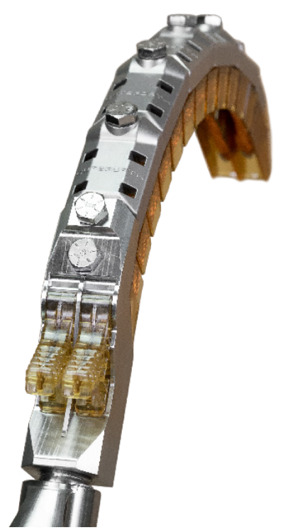
Cutsforth'™ Shaft Grounding Assembly (SGA): Series 3 installs in one-day and pairs with the Series 3 Premium Monitoring System